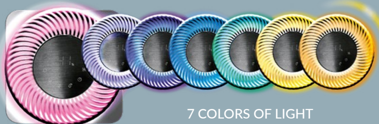
7 COLORS OF LIGHT